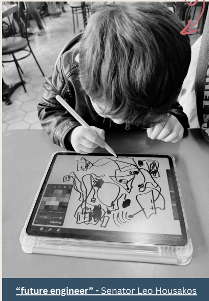
"future engineer" - Senator Leo Housakos